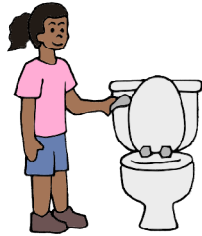
Go to the bathroom